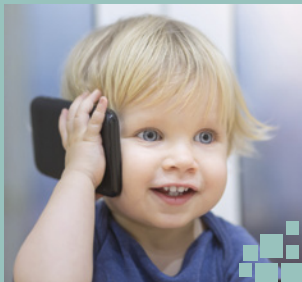
Mobile phones and kids