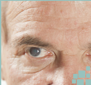
Watch on glaucoma